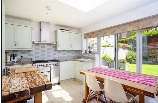
Annandale Road Greenwich SE10 £895,000 Freehold

Immaculate end of terrace of just three modern houses built in this sought after popular residential road. The spacious, well planned and proportioned interior has been extended to the rear offering contemporary living of open plan family dining and kitchen opening out onto the rear garden. There is a separate living room too, utility room and ground floor cloakroom. On the upper floors are three double bedrooms, an ensuite to the master, a large family bathroom with both bath and shower, a walk-in wardrobe. Features include hard wood flooring throughout, off street parking and a pretty garden. Conveniently located for both Maze Hill and Westcombe Park Stations, Royal Greenwich Park, East Greenwich Pleasaunce, Greenwich Town Centre and Halstow Primary school.