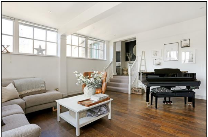
The Coach House, Granville Park £1,150,000 Share of Freehold

Extremely desirable and unique Coach House forming part of this exclusive development located at the upper end of Granville Park just off the open heath. Tastefully and neutrally decorated with many period features having large rooms with a bright light well planned and proportioned interior. Conveniently situated with Blackheath Village a short walk away across the heath and Lewisham Mainline and DLR stations (zone 2) being also within a short walk.