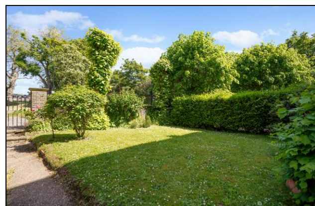
Newton House Granville Park SE13 £2,100 PCM

Desirable Hall Floor apartment set in this grand period home situated on the edge of the heath atop Granville Park. Newly decorated and carpeted with light filled spacious rooms with neutral décor. Large Living Room with private balcony, fitted Kitchen with large fridge/freezer, microwave, oven and hob and washer/dryer. Two Bedrooms and Bathroom. Lovely large communal garden. Located within a moments walk of the open heath and a short distance from Lewisham Station offering fast and frequent Zone 2 rail to the City and West End and Victoria. The DLR to Canary Wharf is also here as is Lewisham Town Centre. Blackheath Village is a short walk in the other direction with its array of shops, restaurants, bars and cafes together with the wide open spaces of the heath.