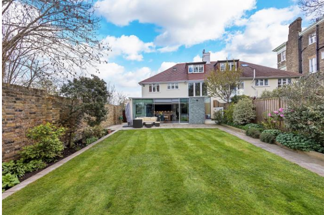
Pond Road £2,500,000 Freehold

A beautifully extended remodelled and totally refurbished family home set in the middle of its walled landscaped gardens in a secluded position on the private Cator Estate. Blending seamlessly the traditional with the sleek contemporary light spacious and well proportioned interior. Located on one of the most sought after roads and just a few minutes walk to the open heath and Blackheath Village with its excellent choice of cafes bars shops restaurants and mainline station. (15 minutes to London Bridge).